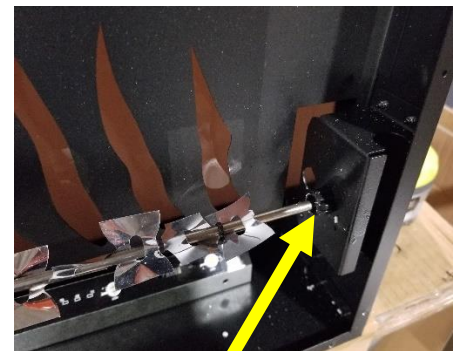
Flame Rod Socket