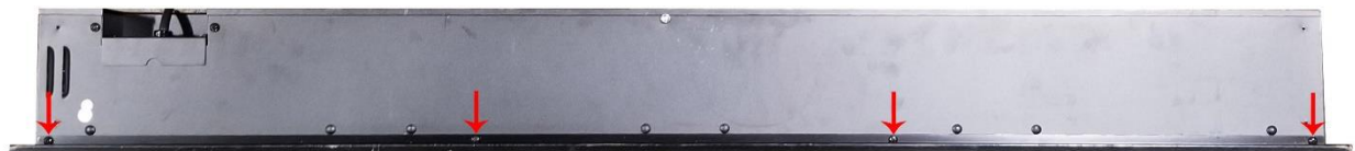
Bottom of Fireplace