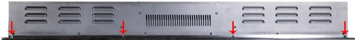
Top of Fireplace

Remove the screws securing the top/bottom trim pieces to the fireplace as shown below: