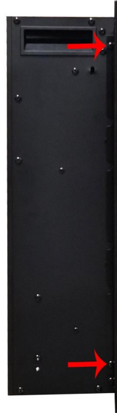
Right Side of Fireplace

**If you have any questions, contact the technical support department at Touchstone Home Products at 800-215-1990 option 3.