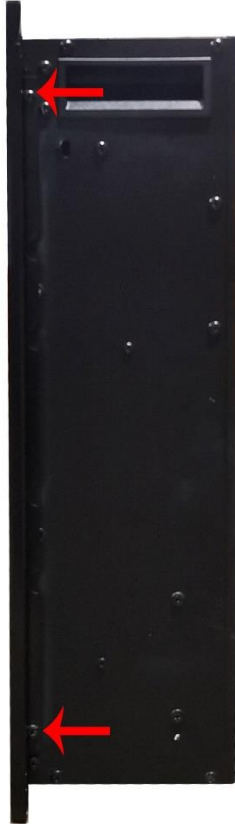
Left Side of Fireplace

Remove the screws securing the side trim pieces to the fireplace as shown below: