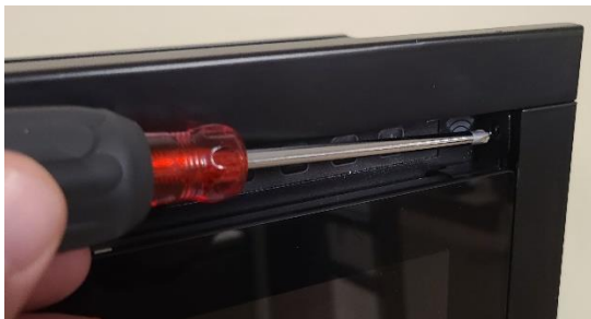
Remove Right Glass Screw