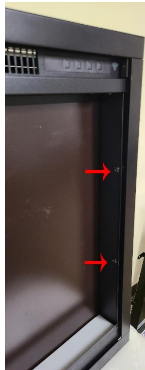
Remove screws from right side panel