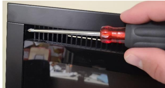
Remove Left Glass Screw

**If you have any questions, contact the technical support department at Touchstone Home Products at 800-215-1990.