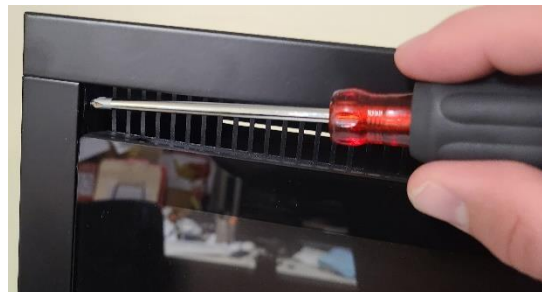
Remove Left Glass Screw