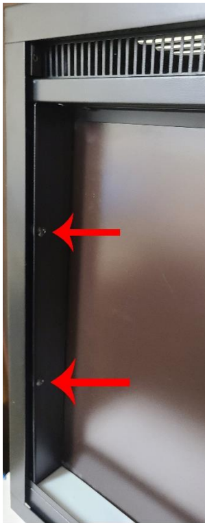
Remove 2 screws from left side panel