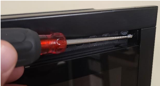
Remove Right Glass Screw