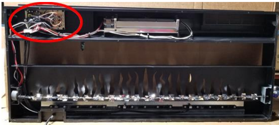
Inside of Fireplace with Back Panel Removed