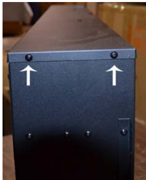
Remove 2 screws on left side of fireplace