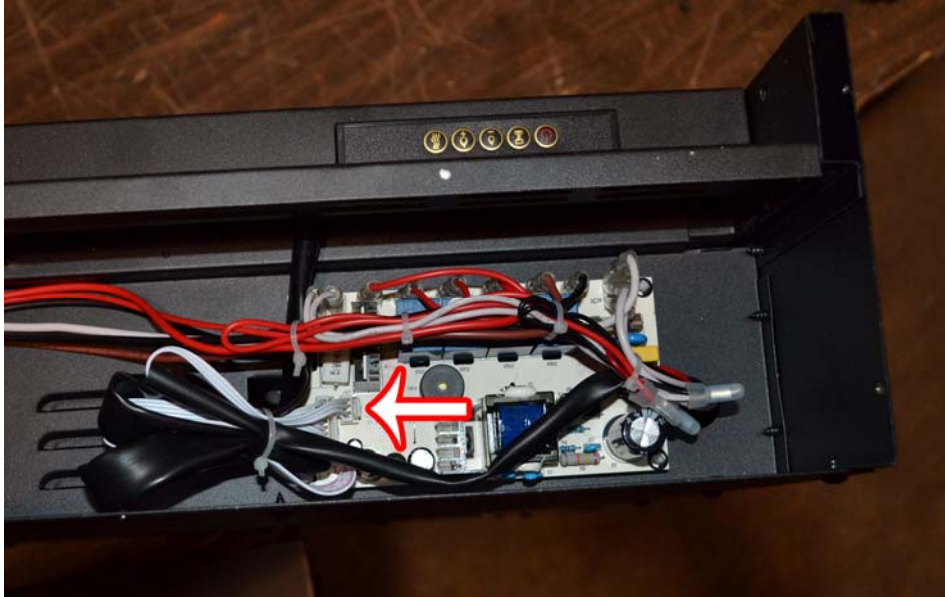
The arrow in the picture above points to the cable for the IR Remote Receiver

4. After removing the top, locate the control board for the Sideline Fireplace. The control board is on the left side of the unit, when facing the front of the fireplace (the picture below shows the location of the control board when looking at the back of the fireplace)