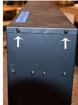
Remove 2 screws on right side of fireplace