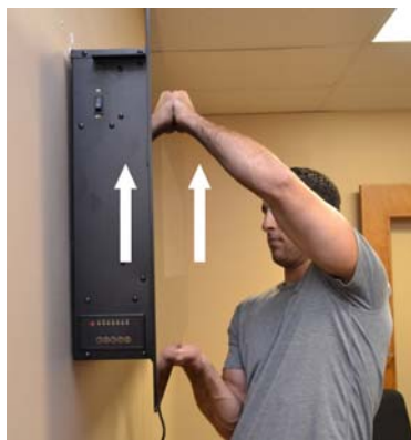
a. lift panel up

2. Carefully, lift and remove the glass panel from the front of the fireplace. The front panel hooks onto the fireplace unit. With 2 people, lift the panel toward the ceiling and then pull the panel out away from the unit. Install replacement glass .