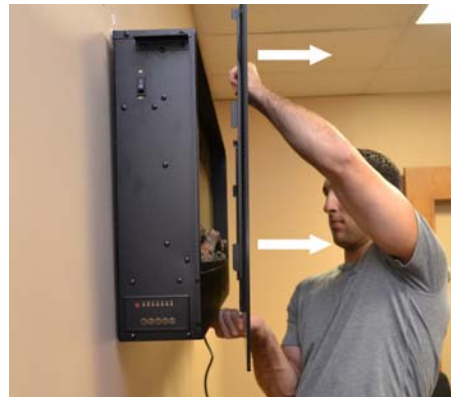
b. pull panel away from unit

NOTE: While we show only 1 person removing the glass, we recommend that 2 people remove the glass from the fireplace unit.