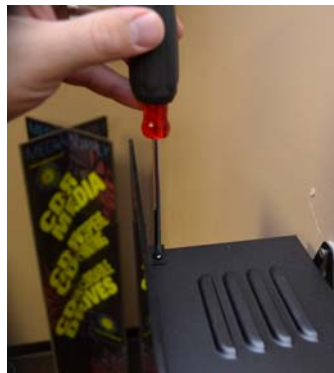
a. remove left screw