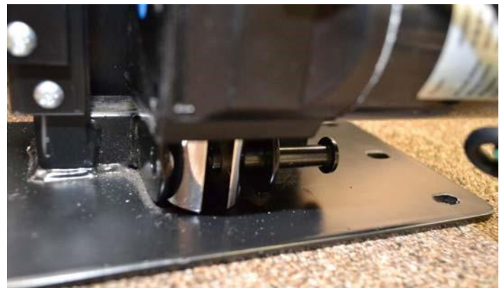
b. Remove bottom locking pin