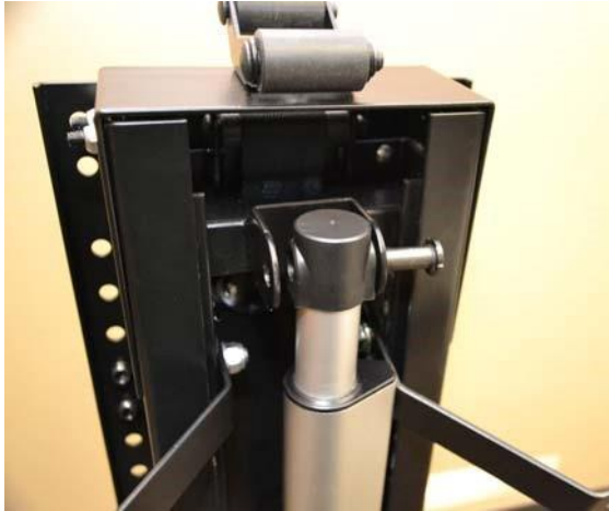
a. Install top locking pin

9. Line up the hole in the top of the actuator motor with the mount on the back of the Whisper Lift II body and install the top locking pin and cotter pin.