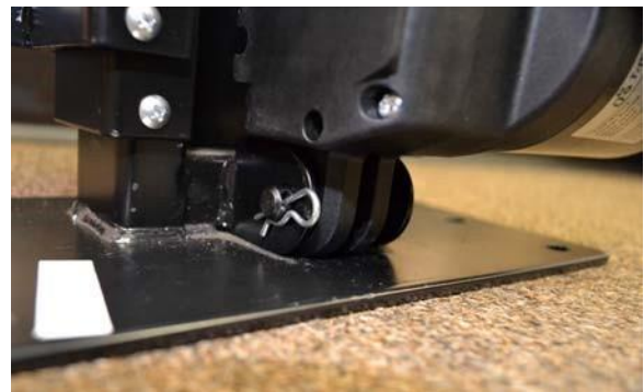
b. Install bottom cotter pin