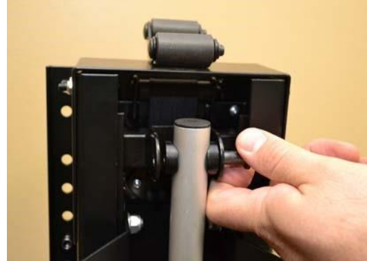
b. Remove top locking pin

6. Remove the bottom cotter pin and bottom locking pin that attaches to the actuator motor to the Whisper Lift II body.