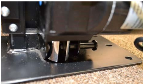
a. Install bottom locking pin