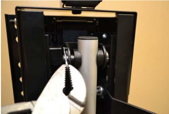
a. Remove top cotter pin

5. Remove the top cotter pin and locking pin that attaches to the actuator motor to the Whisper Lift II body.