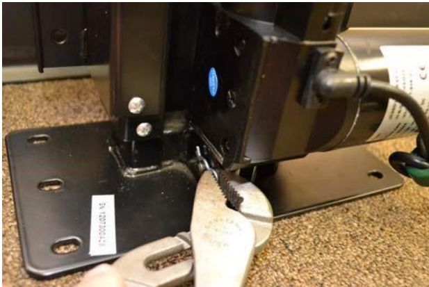
a. Remove bottom cotter pin

6. Remove the bottom cotter pin and bottom locking pin that attaches to the actuator motor to the Whisper Lift II body.