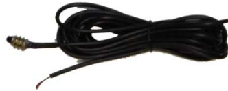
IR Sensor Cable

If you plan to use the Whisper Lift II PRO Advanced TV Lift with an existing IR remote control, attach the IR sensor to port B on the side of the control box.